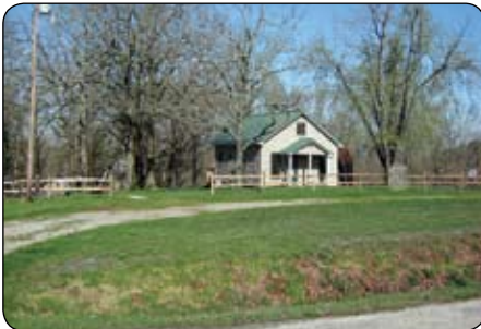
21.7 ACRES! - THE OLD HOME PLACE • $159,900

Barn, cellar, shed & refurbished home. #333797 Call Louanne 417-337-1627