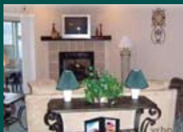
Luxurious walk-in condo. Partially furnished, 9 ft. ceilings, built in wet bar and gas fireplace. #340740 $174,900