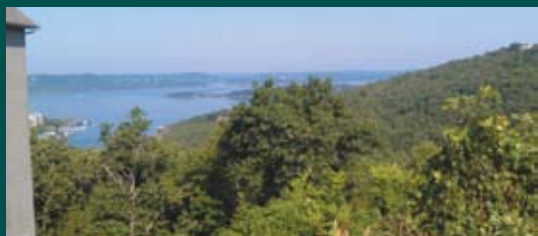
This lot has everything you are looking for! Beautiful main channel views, in Emerald Pointe's gated community. #342445 $130,000