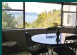
Lake living at its best! Spectacular main channel view from 2 nd floor 2BR, 2BA. Plenty of amenities. #343458 $244,900