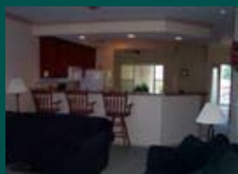
Ground floor, end unit, lake front, lake view! Patio and sunroom! #339312 $205,000