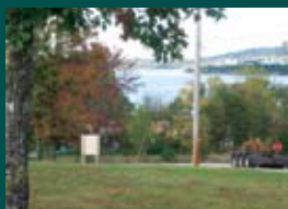
Corner lot with a great view of Table Rock Lake. Double lot with septic installed, only 20 minutes to downtown Branson. #339871 $87,400