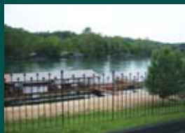
3 Pools, clubhouse, carport & fishing dock. 55 & Older. The best retirement or vacation home on Lake Taneycomo. #341644 $90,000