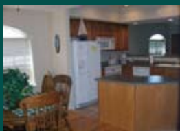
Great main channel lake view, 2nd floor, totally furnished with sunroom. #339315 $219,000