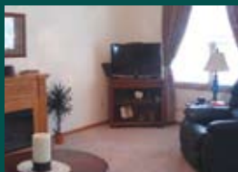
Forest Park Estates, totally furnished and just like new! #344175 $134,900