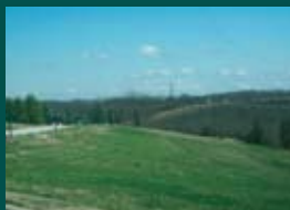
Ready to build your dream home! Extra large corner lot, gated community. #334247 $144,900