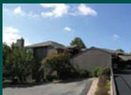
Close to downtown Branson and within walking distance to Branson Landing. Owner finance. #340469 $105,000