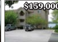
Table Rock Sunsets

$159,000 What a fantastic lakefront condo & it can be a nightly rental if you want. This 2BR, 2BA unit is a lower level walk-in, great for children and pets! Completely furnished all upscale and turn key ready. Enjoy the sunsets of Table Rock Lake from your private patio. Doesn't get any better than this. There is a dry dock storage & courtesy dock, club house, pools & easy location to other attractions. #335168